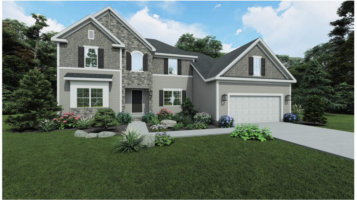
KENWOOD AMERICAN TRADITION