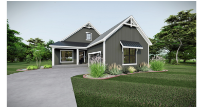
DAWSON MODERN FARMHOUSE