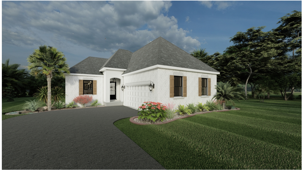
DAWSON FRENCH COUNTRY