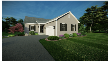
DAWSON AMERICAN TRADITION