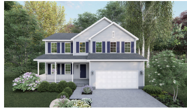
ASHLEY AMERICAN TRADITION