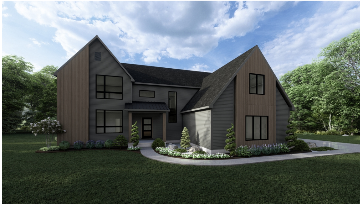
WINDSOR III MODERN