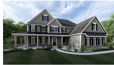
WINDSOR III AMERICAN TRADITION