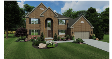
CALLAWAY AMERICAN TRADITION