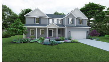
WINDSOR AMERICAN TRADITION