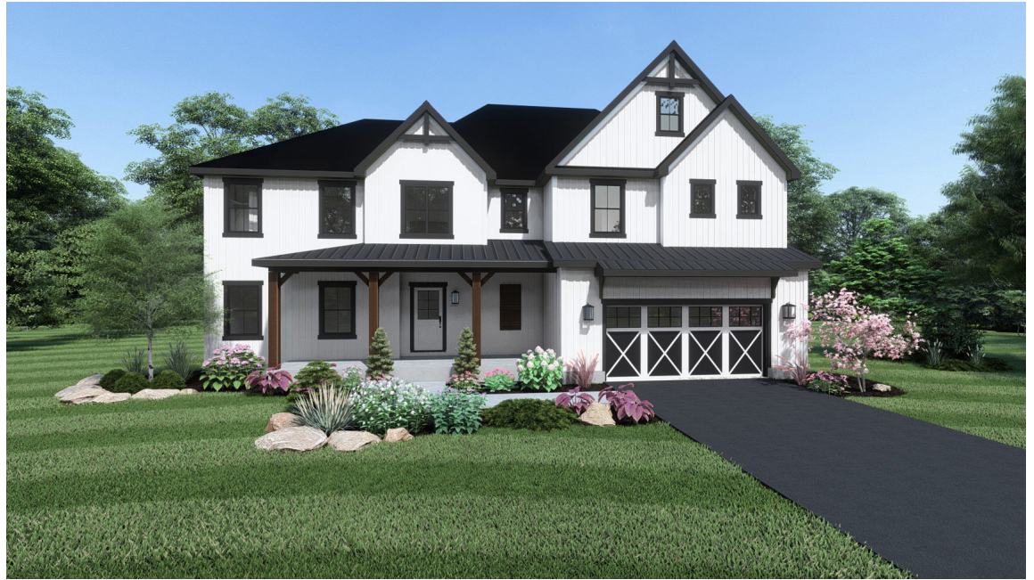
WINDSOR MODERN FARMHOUSE