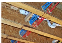
PEX WATER SYSTEM The Schumacher Way

We build with AdvanTech® subflooring for award winning performance you can rely on. Specifically engineered to combine industry-leading strength, superior moisture resistance and installation ease, AdvanTech® subflooring is the FLAT OUT BEST™ for a quiet, high performance subfloor. Most subflooring when exposed to water tends to swell and break down resulting in cracked ceramic tile or buckled hardwood, not with AdvanTech®. We even take it one step further and nail, screw and glue the reduce flooring squeaks.