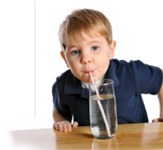
When it comes to your drinking water - the choice is clear