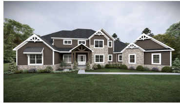
WEST POINT II CRAFTSMAN