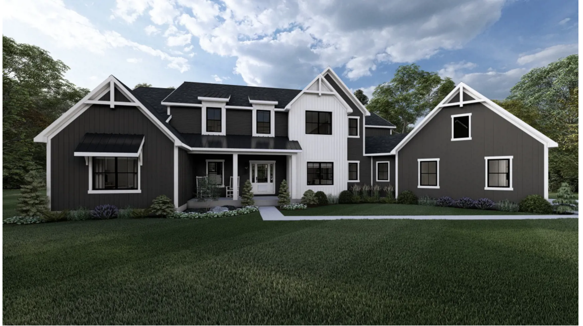
WEST POINT II MODERN FARMHOUSE