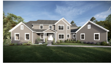
WEST POINT II AMERICAN TRADITION