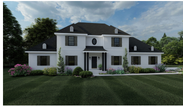
CHAPEL HILL FRENCH COUNTRY