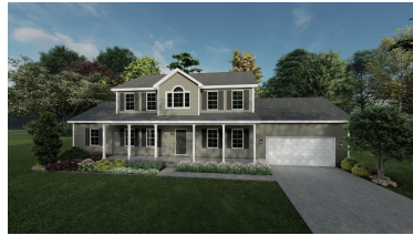
CHAPEL HILL CLASSIC