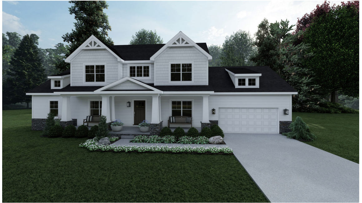
CHAPEL HILL CRAFTSMAN