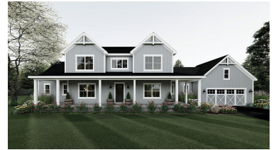
CHAPEL HILL MODERN FARMHOUSE