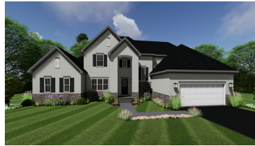
LEXINGTON FRENCH COUNTRY