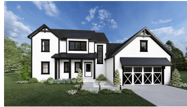
HALSTED II MODERN FARMHOUSE