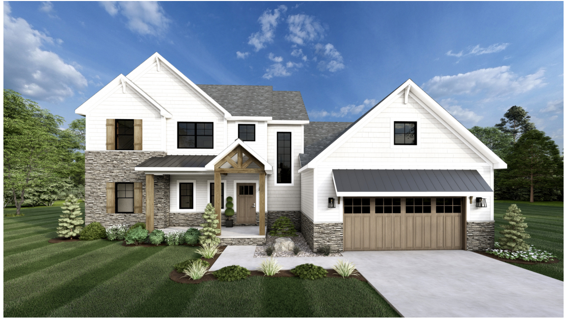
HALSTED II CRAFTSMAN