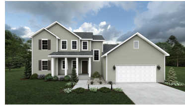
HALSTED II AMERICAN TRADITION