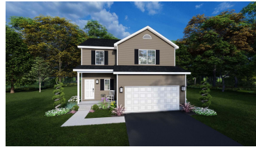
MONTEREY AMERICAN TRADITION