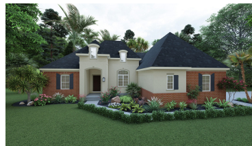
ABERNATHY FRENCH COUNTRY