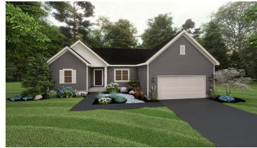
ABERNATHY AMERICAN TRADITION