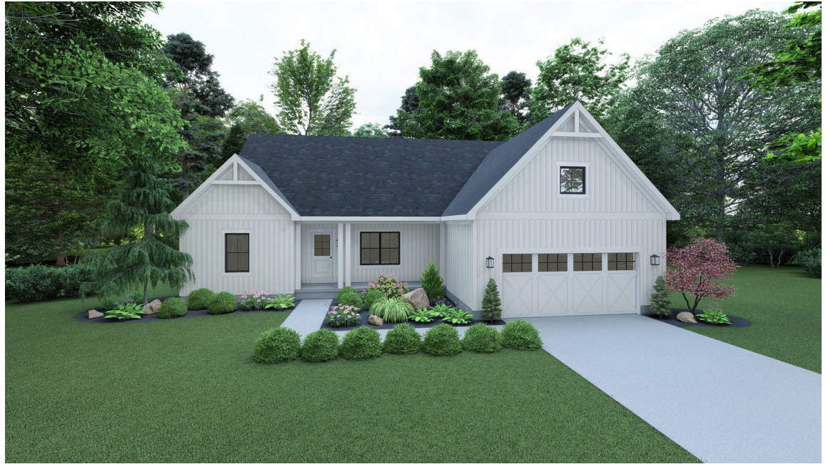
ABERNATHY MODERN FARMHOUSE