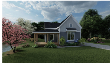
EAGLE'S NEST MODERN FARMHOUSE