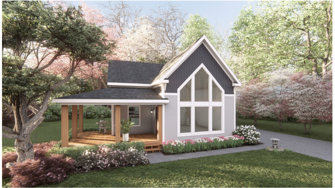
EAGLE'S NEST AMERICAN TRADITION