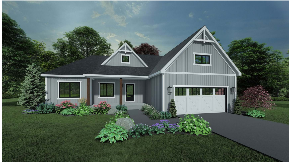
DAVIDSON MODERN FARMHOUSE