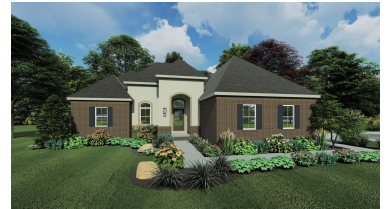
DAVIDSON FRENCH COUNTRY