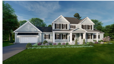
BELLEVILLE AMERICAN TRADITION