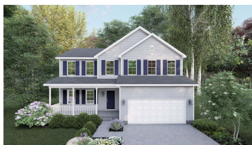
ASHLEY AMERICAN TRADITION