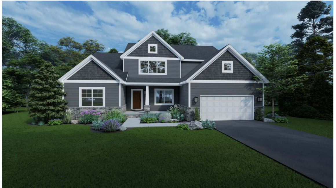
OLIVIA II CLASSIC