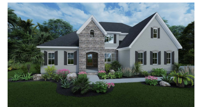
OLIVIA II FRENCH COUNTRY