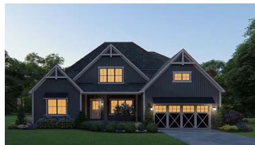
OLIVIA II MODERN FARMHOUSE