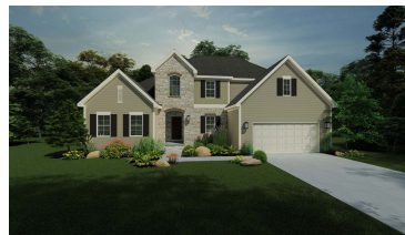
OLIVIA II AMERICAN TRADITION