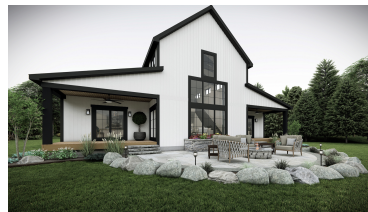
HEARTLAND MODERN FARMHOUSE