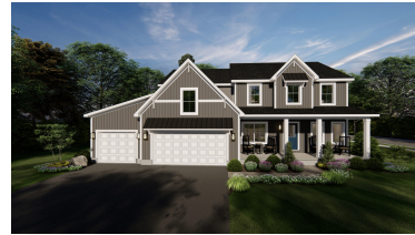
EMERSON MODERN FARMHOUSE