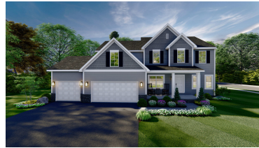
EMERSON AMERICAN TRADITION