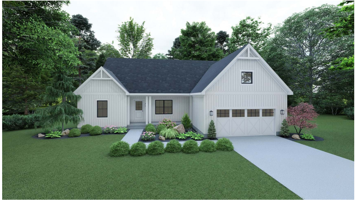
ABERNATHY MODERN FARMHOUSE