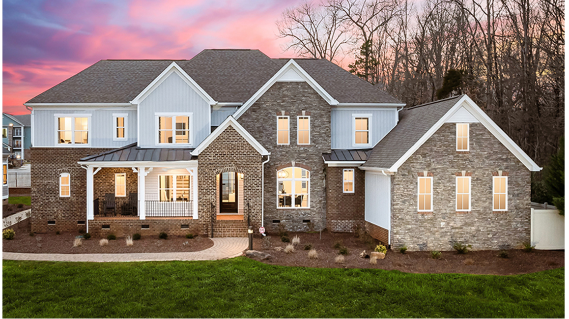
VINEMONT AMERICAN TRADITION