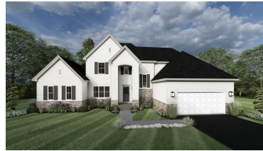
LEXINGTON FRENCH COUNTRY