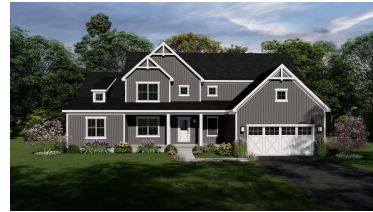
LEXINGTON MODERN FARMHOUSE