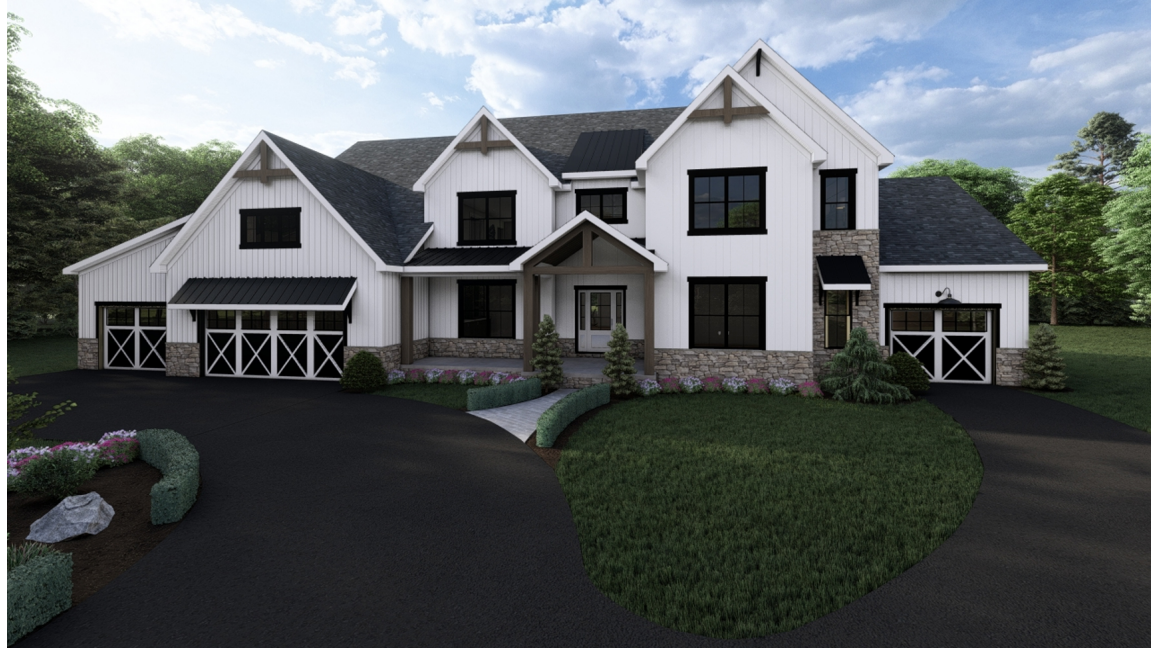
DUNKEITH MODERN FARMHOUSE