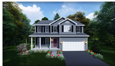
ABERDEEN AMERICAN TRADITION