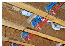
PEX WATER SYSTEM The Schumacher Way