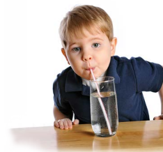
When it comes to your drinking water - the choice is clear