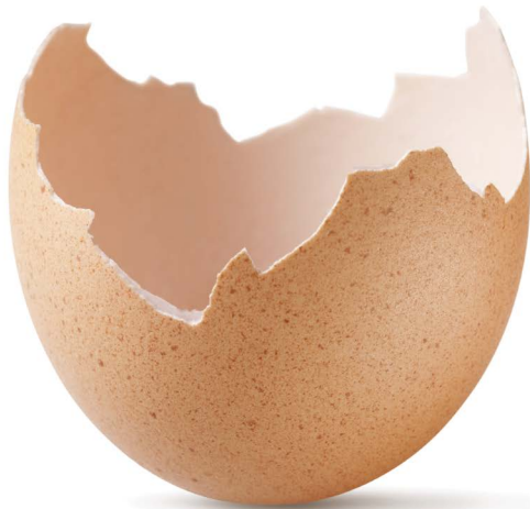
Average Construction Practices